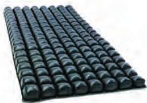
E0371 ROHO® SOFFLEX® 2