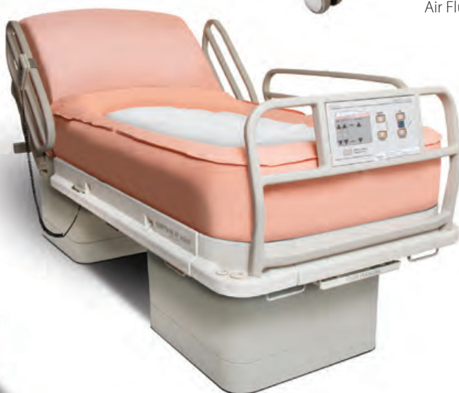
E0194 Clinitron® At Home® Air Fluidized Therapy