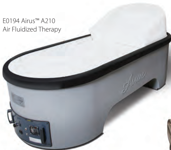
E0194 Airus™ A210 Air Fluidized Therapy