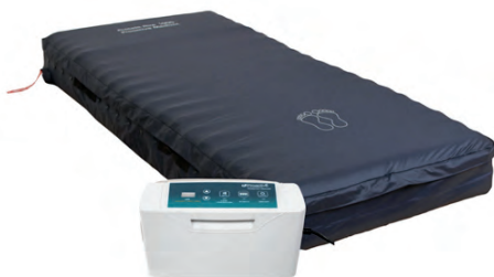
E0277 Protokt® Aire 4000DX