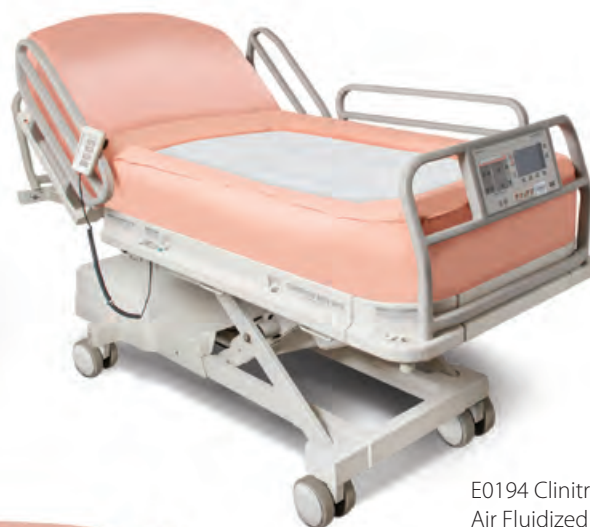
E0194 Clinitron® Rite Hite® Air Fluidized Therapy