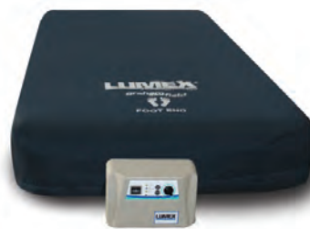
E0277 Lumex® LS200